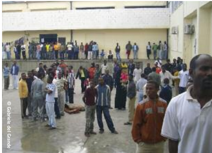
Refugees and migrants in the yard at Misratah Detention Centre, Libya, November 2008.

Research by Amnesty International and other human rights groups has exposed widespread abuses against refugees, asylum-seekers and irregular migrants in Libya during Colonel al-Gaddafi’s rule, as well as during and following the conflict that deposed him. 4 Documented violations and abuses include indefinite detention in extremely poor conditions, beatings and other ill-treatment, in some cases amounting to torture. Refugees and asylum-seekers also face a real risk of refoulement (being returned to a country where they are at risk of persecution or serious human rights abuses). Libya is not a party to the 1951 UN Convention relating to the Status of Refugees and its